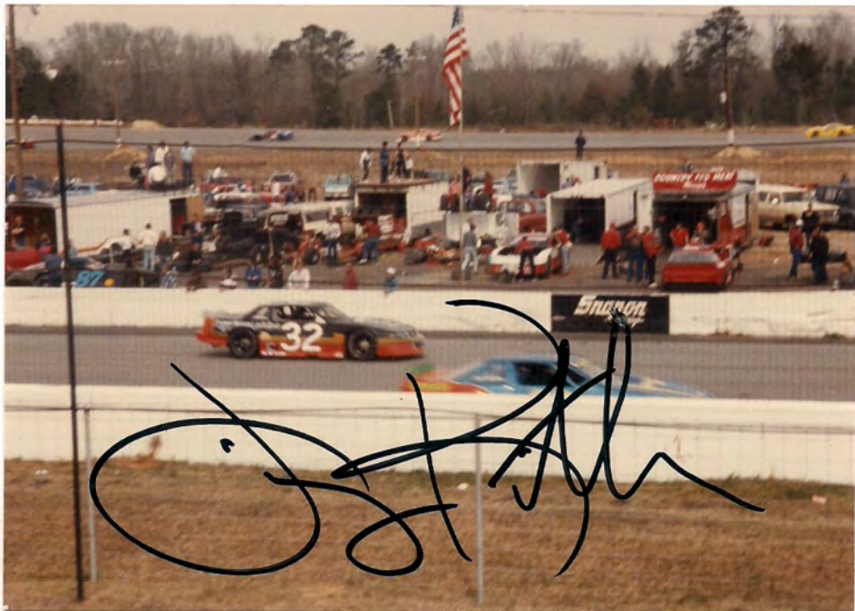
MIR 2-28-93. Jimmy Kitchens - Late Model #32 from Pleasant Grove, AL