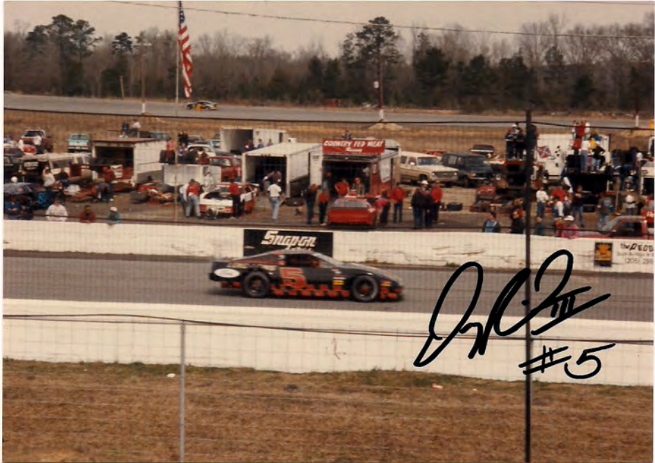
MIR 2-28-93. Doug Reid III - Late Model #5 Ford Probe from Hueytown, AL