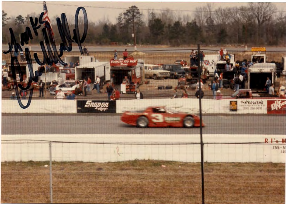
MIR 2-28-93 Chris Mullinax - Late Model #3 from Forestdale, AL