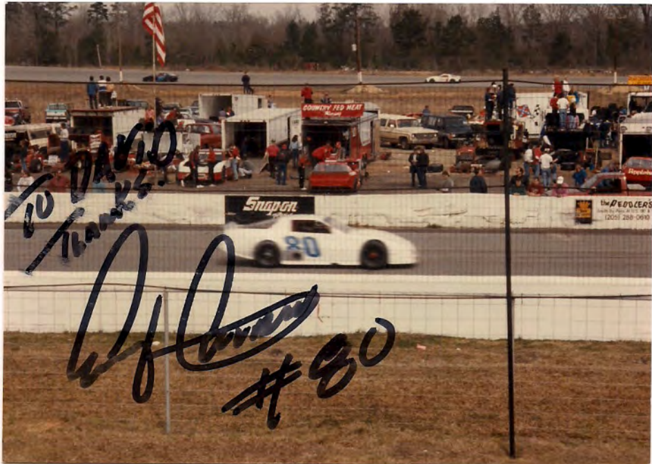
MIR 2-28-93. Tony Formosa - Late Model #80 from Nashville, TN